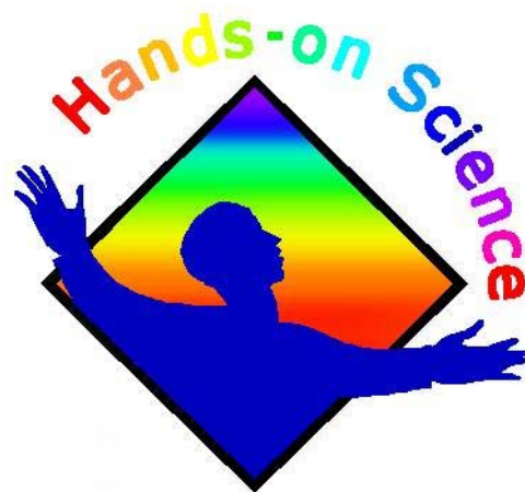
Figure 2. The "Ideas for Science Fairs" European contest is expected to involve many hundred students all over Europe.

In January 2004 we launched the 1 st European Contest on "Ideas for Science Fairs" with which we hope to induce the generalisation of the organisation of Science fairs in the Schools.