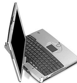
Picture 2 TravelMate C100

TabletPC is a palmtop according to its size and weight, however it also offers possibilities of a desktop. We can write with a special electronic pen practically anywhere on the screen and the software enables us to save these notes in their original form or in the form of a text which can be used in Word, Excel, PowerPoint etc. TabletPC actually combines paper and pen in a PC. Any software designed for WindowsXP can also be used on TabletPC and WindowsXP for TabletPC enables us to use a pen. Since mobility is the basic characteristic of all TabletPCs, each one has a interface