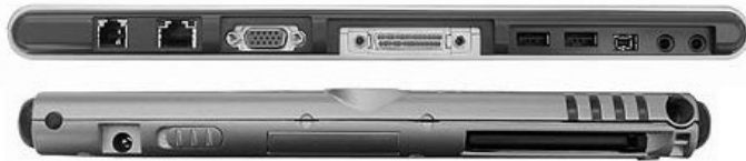
Picture 3 Connectors

for wireless communication. Naturally, all have an inbuilt discs which may be of different sizes, some have inbuilt keyboards, others do not. Other units like a CD or a disc may also be added. They all have many interfaces (VGA, modem, USB, FireWire, some even BlueTooth) and some have PCMCIA, SmartCard, MemoryStick, CompactFlash added.